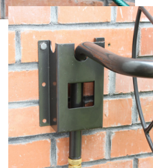
Other fixing position