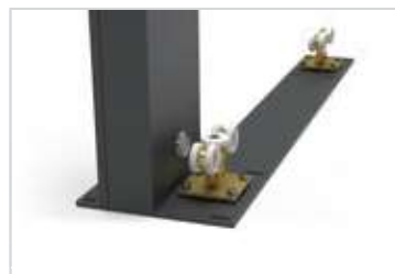
Integrated plate with trolleys