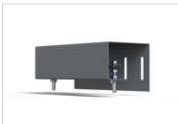
Alternative upper guiding system