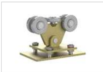
Trolley for self-supporting gates