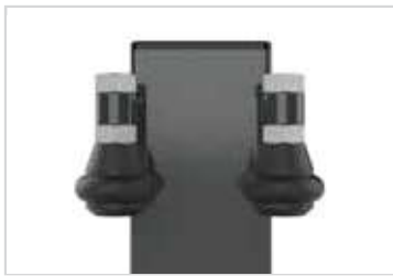
Access strip for self-supporting gates