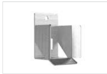
Ramp for self-supporting gates