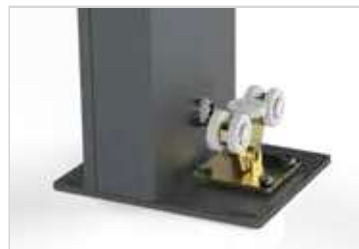
Post with automation