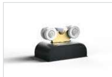
Panel covers for trolleys