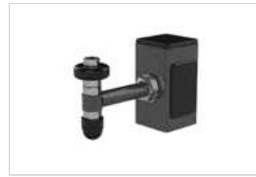
Guide roller for self-supporting gates