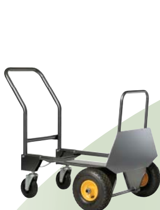
Converts into a trolley

Designed for heavy duties. Loading capacity 200 kg.