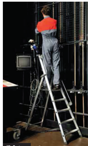
XL 5 steps