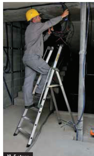
XL 5 steps