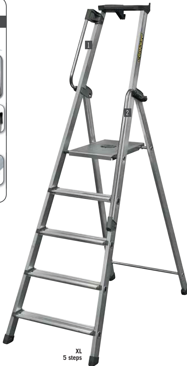
XL 5 steps

Tested to comply with the requirements stipulated in paragraph 5.8 of European standard EN131.